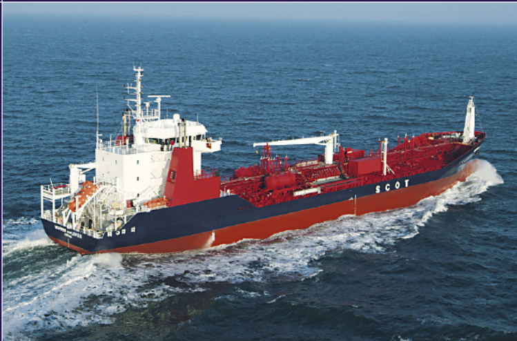
“WAPPEN VON LEIPZIG”