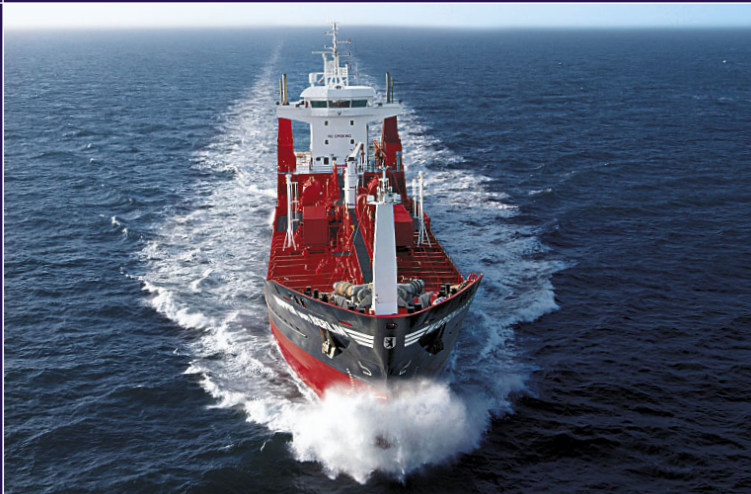
“WAPPEN VON BERLIN”